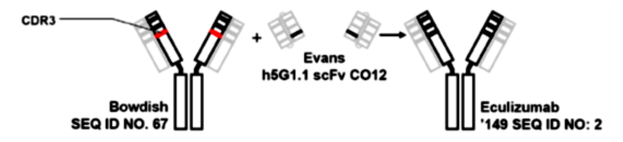
Id. at 34; see also Ex. 1003 ¶ 122. The figure above illustrates reverse engineering the Bowdish antibody based on its disclosure that Evans teaches the "[c]onstruction of 5G1.1" antibody, into which Bowdish's TPO mimetic peptide graft was inserted (shown in in red) "to replace the native CDR3 [represented by the middle image above—Evans's h5G1.1 scFv CO12,] with 5' ttg cca ATT GAA GGG CCG ACG CTG CGG CAA TGG CTG GCG CGC GCG cct gtt 3' (SEQ. ID. NO: 65)." Ex. 1004 ¶ 191; see also Ex. 1003 ¶ 122. Bowdish states that "[t]he 5G1+peptide was produced as a whole IgG

This argument is illustrated by the following figure from the Petition, incorporated from the Ravetch Declaration: