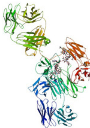
Adalimumab C 6428 H 9912 N 1694 O 1987 S 46

44. Due to a biologic's complexity, biosimilars, the generic equivalent of biologics, are generally more challenging and expensive to produce than small-molecule generic drugs. Products containing living cells are sensitive to their environments; to produce a product that is sufficiently similar to the pioneer biologic, a biosimilar manufacturer must create unique processes to manipulate the cells. Further, slight variations in the chemical structure of each biosimilar make it more challenging to achieve consistent clinical study results.